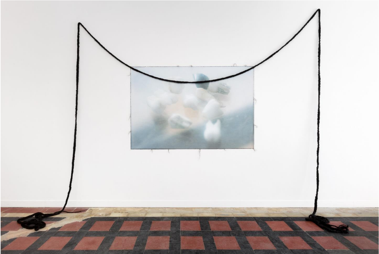
3. Loss. 2019