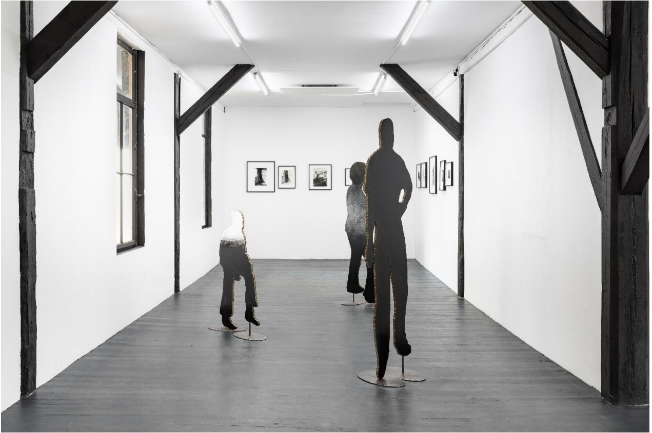
1. Untitled (for scale). 2021. c Kilian Bannwar