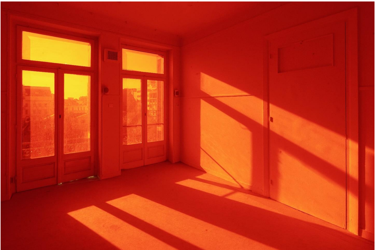
2. Untitled (in rage), 2021. c Gisler. Nysos Vasilopoulos